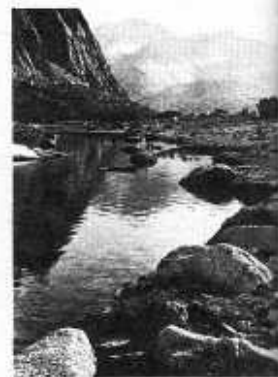
Gentle Wilderness THE SIERRA NEVADA

A new reprint edition of the Sierra Club's beautiful, original