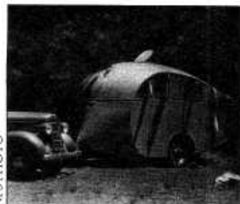
This "tear-drop" camping trailer was allegedly Elmer's stronghold.

That, of course, was just the beginning. Next morning "cries