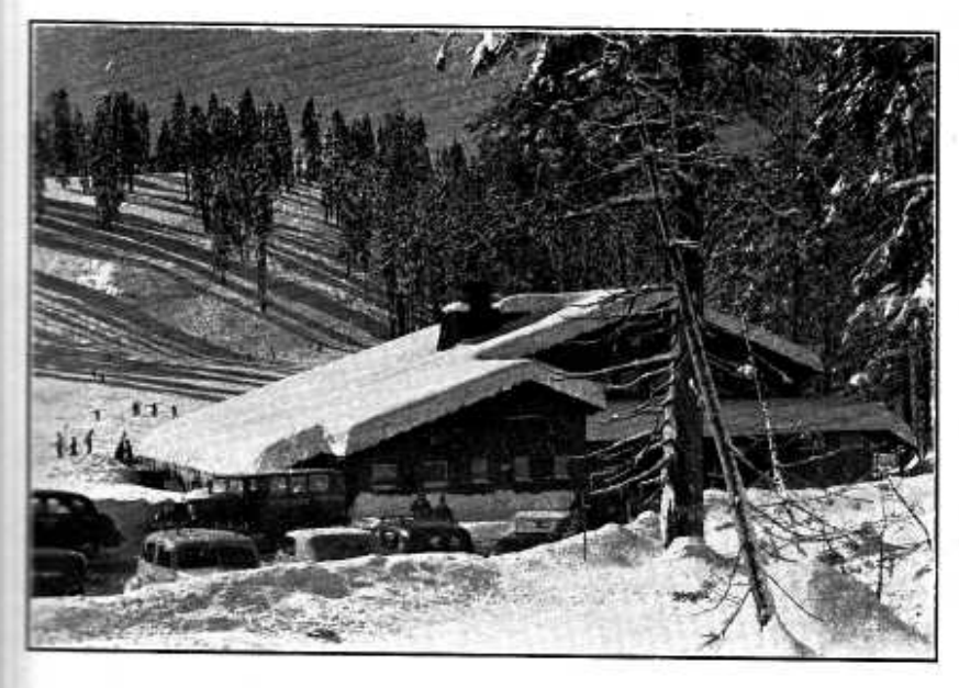
Badger Pass Ski House