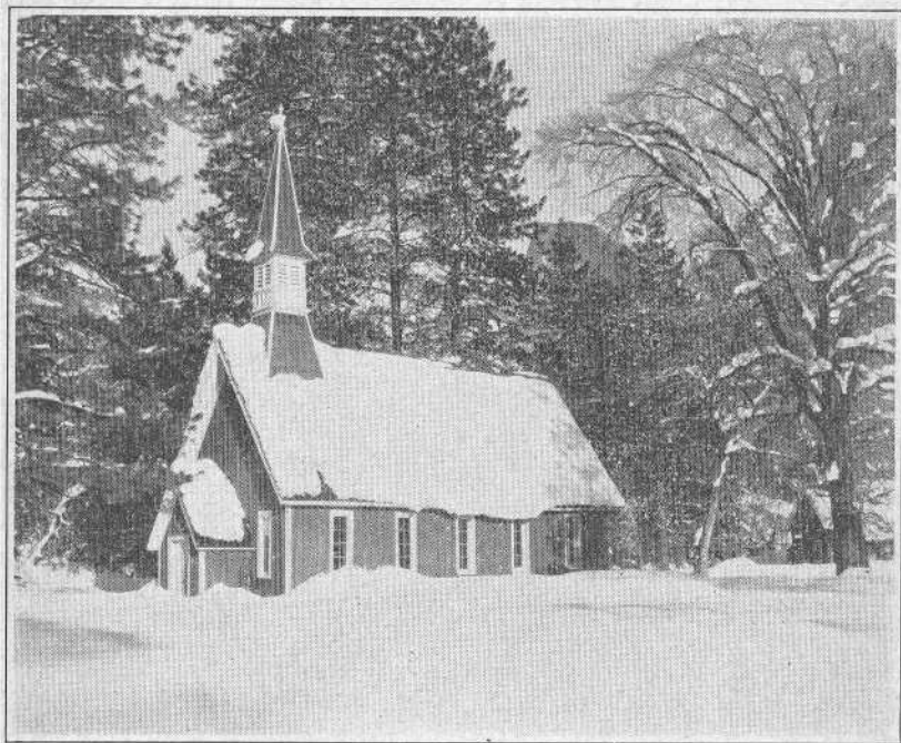
YOSEMITE CHAPEL IN WINTER