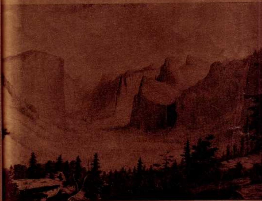
The First Drawing Made in Yosemite

First pencil sketch of Yosemite Valley made by Thomas Ayers in 1855, exhibited in Yosemite Museum