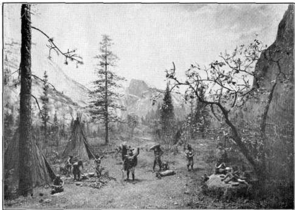
Yosemite Valley Indian Diorama, in Yosemite Museum

In the earliest stages of the gold rush in the Yosemite region these Indians gave but little trouble. The