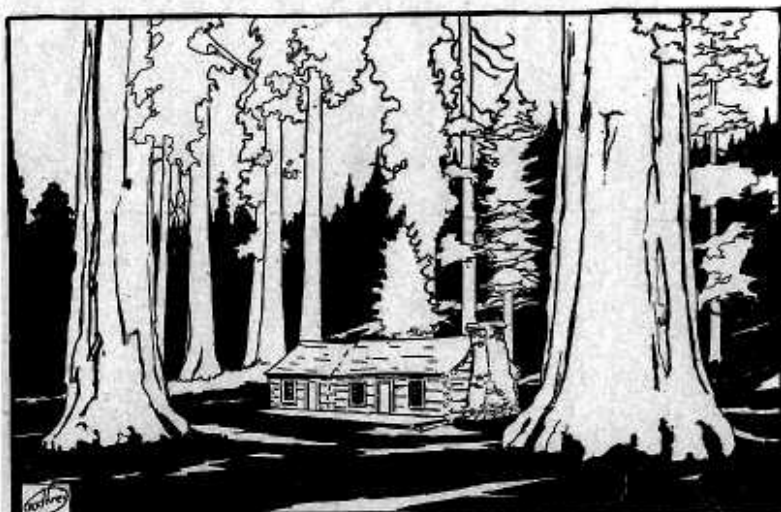
Mariposa Grove Museum