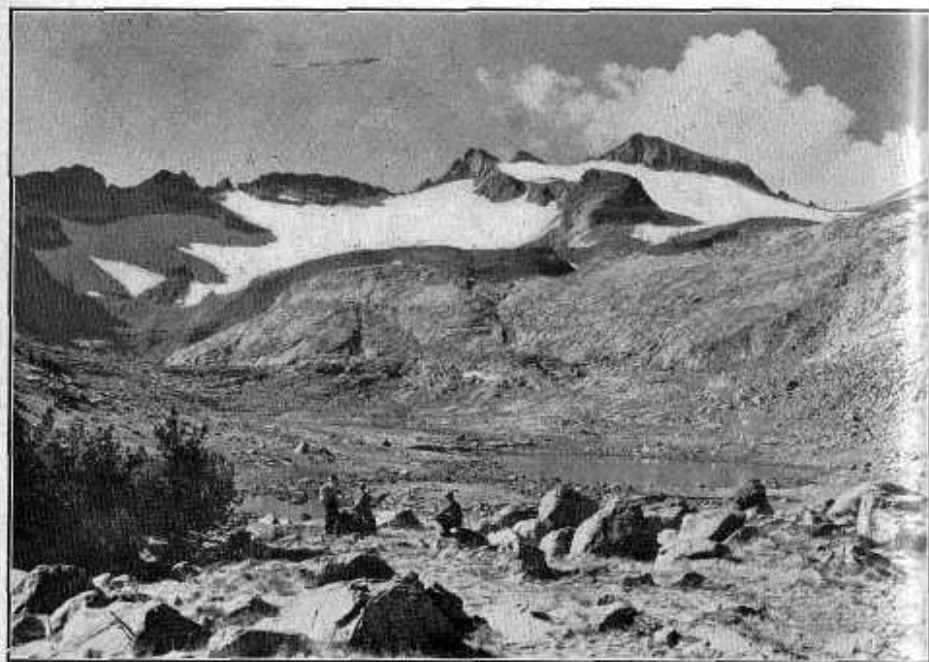
Mount Lyell and the Lyell Glacier

Despite the heavy rain, sleeping quarters under the whitebark pines were available with only a little scraping away of the duff. The pud-