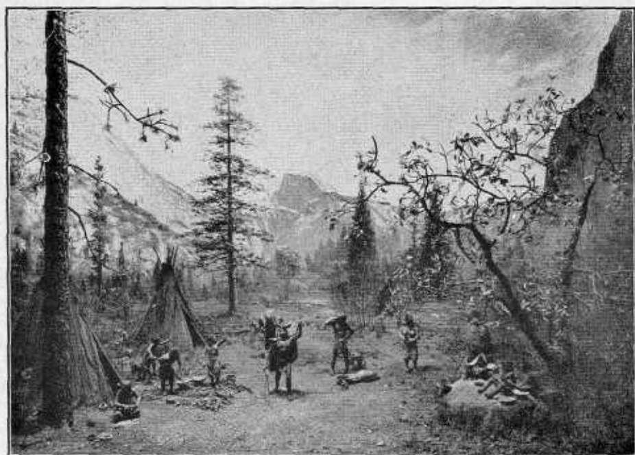
Yosemite Valley Indian village diorama, in Yosemite Museum

were identified. Many of the earlier recorded villages, especially those described by Merriam, are uncertain as to location. This may be due to the fact that the land claimed by an Indian village outside of the actual living area was called by the same name as the village, which, on Merriam's map, did not pinpoint the village position. The University of California survey grouped the 41 mortar-rock sites, which were earlier listed as individual sites, into 29 groups. This figure cannot be considered as the final correct figure, however, because the survey lacked sufficient time to probe beneath the leaf-mold and pine-needle cover. No evidence of Indian habitation in late Pleistocene glacial features was found.