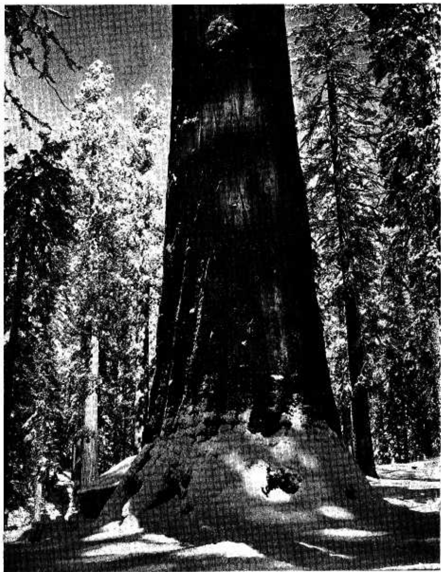
In the Mariposa Grove of Giant Sequoias, winter. By Ansel Adams from "Yosemite and the Sierra Nevada", permission of Houghton Mifflin Company.