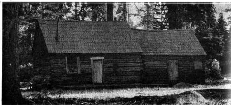
Curtin's Gin Flat cabin, in good condition in the early 1930's, is now in ruins.

was on the premises that has long since disappeared.