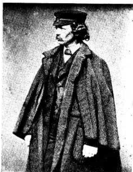
Frederick Law Olmstead