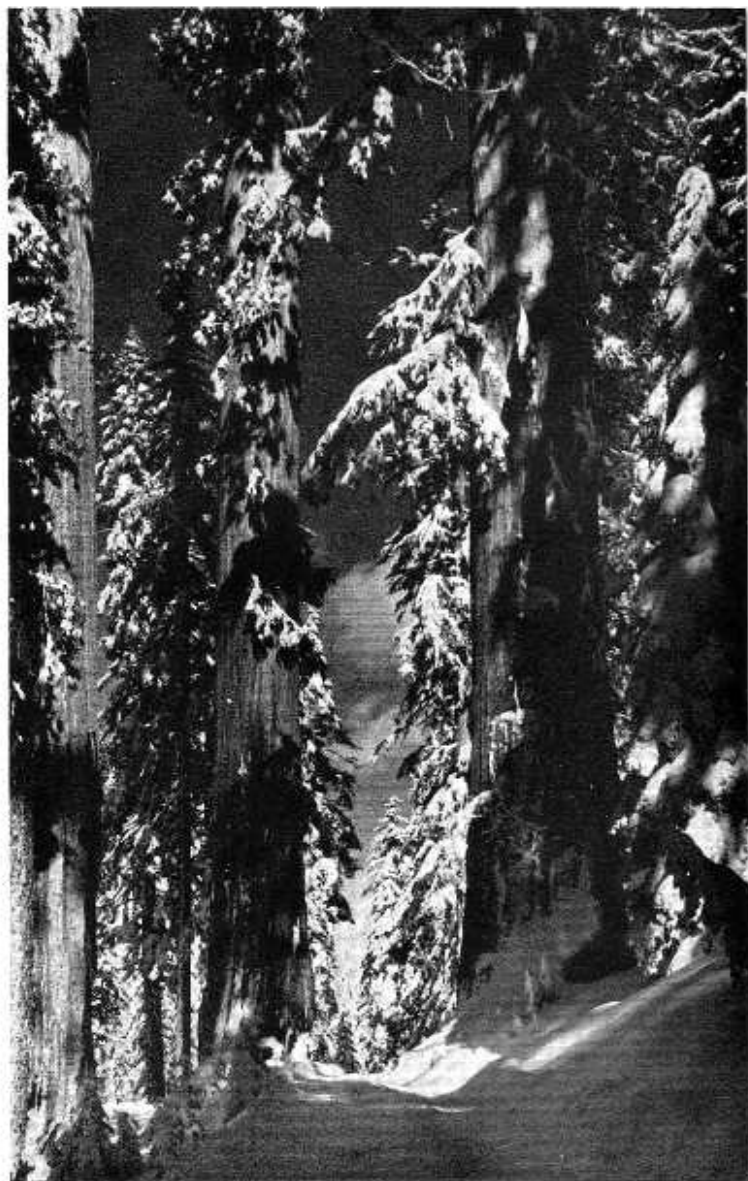
Mariposa Grove, Winter