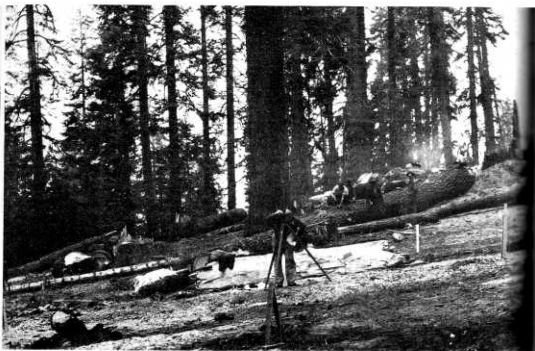
Surveying for new road alignments.

These data are not in themselves shocking to anyone versed in travel trends, but consider the full impact to the Incomparable Valley. Unless something is done to avoid it , the large majority of these vast numbers will continue to pour into the seven square miles of the tiny valley itself, seeking accommodations and services which the already crowded and inadequate facilities cannot provide.