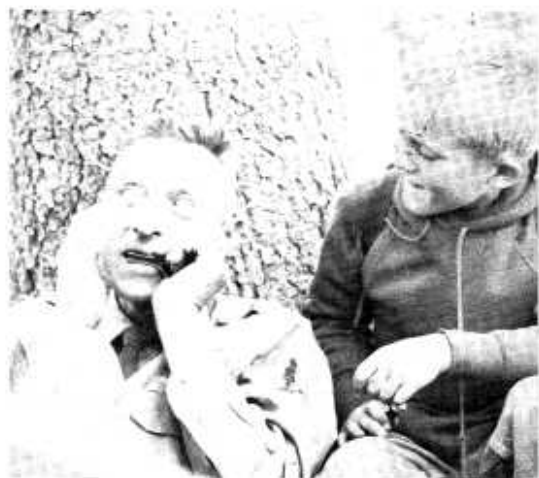
I dared not stop.

John Muir in his "Mountains of California" tells of the charm his whistled tunes had for the Douglas squirrel (chickaree). Old packers working with Yosemite's trail crews