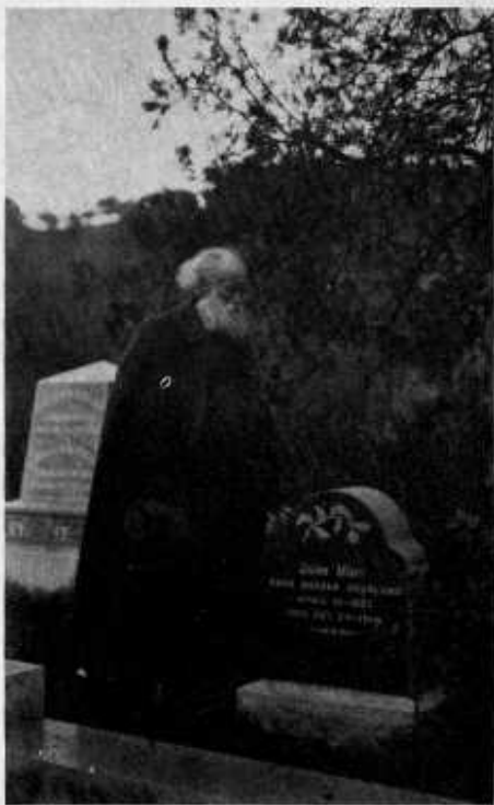
John Burroughs visiting John Muir's grave.

In the late afternoon, after adjourning for the day, John Muir and I would take walks on the valley floor. It was early October and down the valley the cliffs and forests were bathed in the intense blue and purple light that is characteristic of autumn. We sauntered through the abandoned campgrounds which only two or three months earlier had teemed with campers and noted how quickly "nature heals its wounds" for the forest floor was already covered with pine needles and leaves. John Muir took me down below the little chapel and over to the vertical