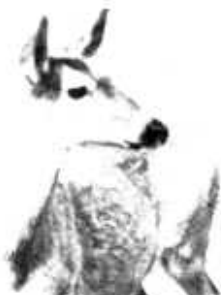
Stock still she stood.

So there we lay, the children and I. Time passed. I had finished my story. The children remained quiet. I was now playing my sweetest on my old harmonica. The little grassy dell, encircled by its dense thicket of young lodgepole pines, was filled with the strains of music as in a quiet room. Only an occasional sour note, blown from the one off-key reed of my instrument, stirred the children now and then into their delighted little laughs. My eyes were closed; I was completely absorbed in giving them the best renditions of my old favorites: "Tipperary;" "K-k-k-Katy;" "Sobre las Olas," etc., when suddenly I was roused from my reverie. With hushed, yet tense voices the children had cried: "Oh, there's a deer!" Yes, sure enough there was a deer. It was a doe. Bounding across the meadow, toward our thicket she came.