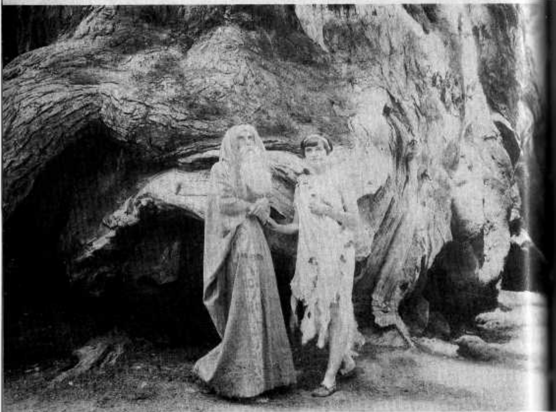
OUT OF YOSEMITE'S PAST — A one picture story. Part of the cast of "Ersa", 1925. Who remembers?

Last month Yosemite Nature Notes grew from 12 to 16 pages. We hope to continue this larger size in spite of rising production costs. Formerly our printing was done by the letterpress method. Now we have gone to rotary offset, which will allow more illustrations.