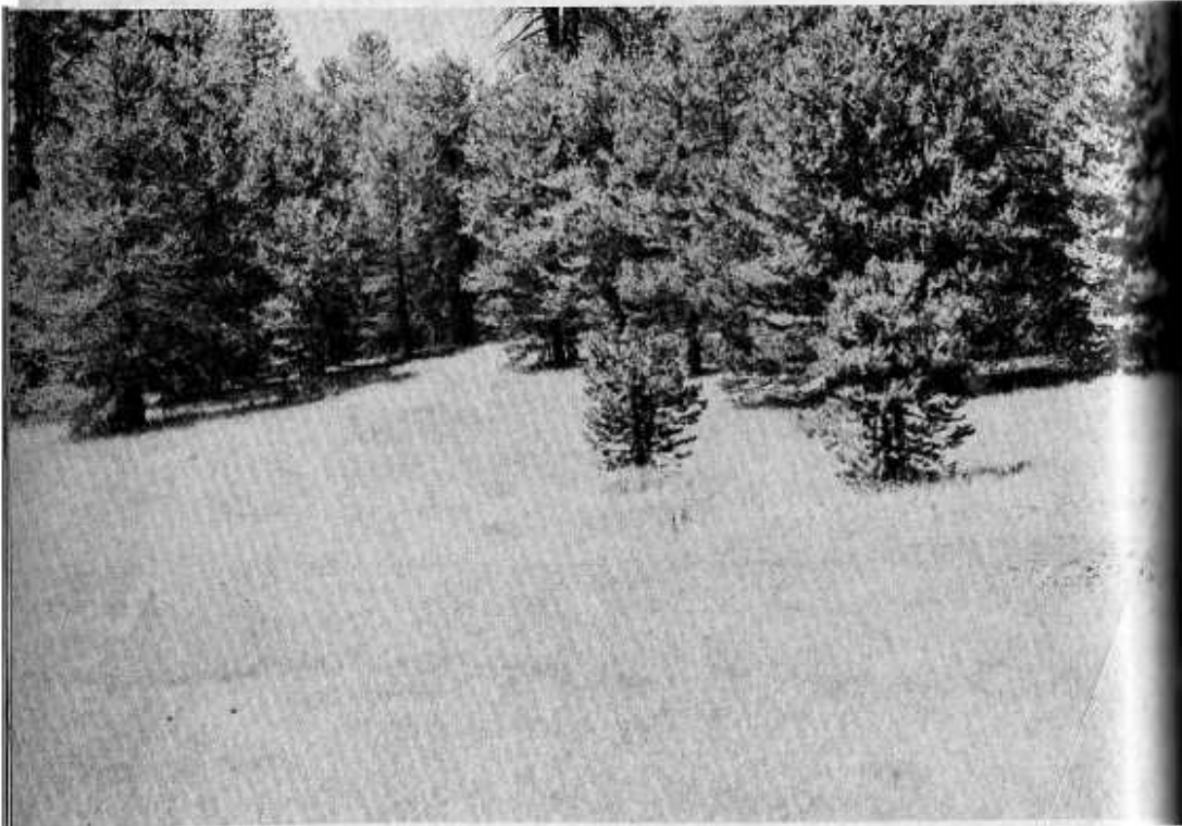
Coyotes keep watch over McGurk Meadow.