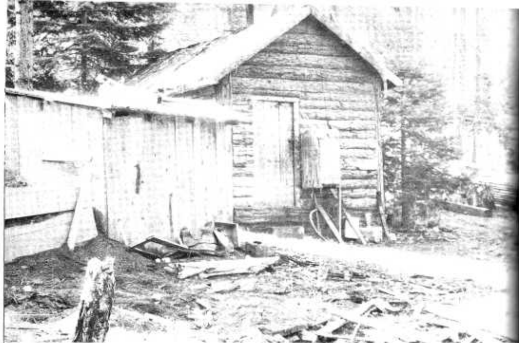
Various types of homes are found on private lands.