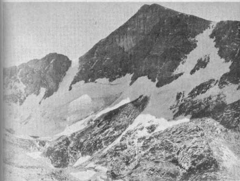
Mt. Dana, Canyon, and Glacier.