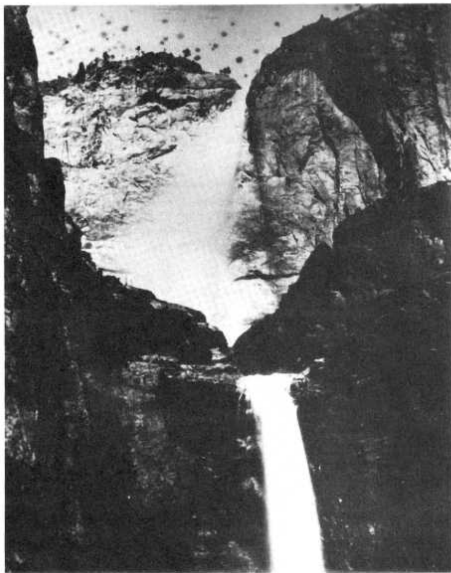
Yosemite Falls. The first photograph taken in Yosemite Valley. The original print is at The Stanford Library.