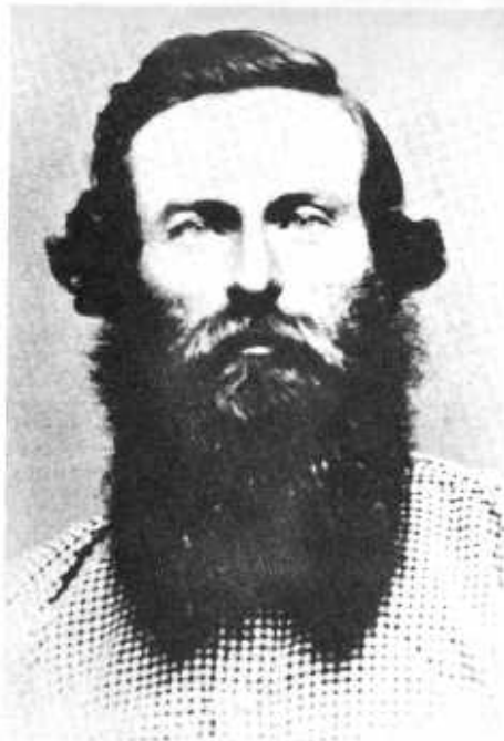
James Mason Hutchings, 1859

fallen log just as Hutchings describes it on page 392.