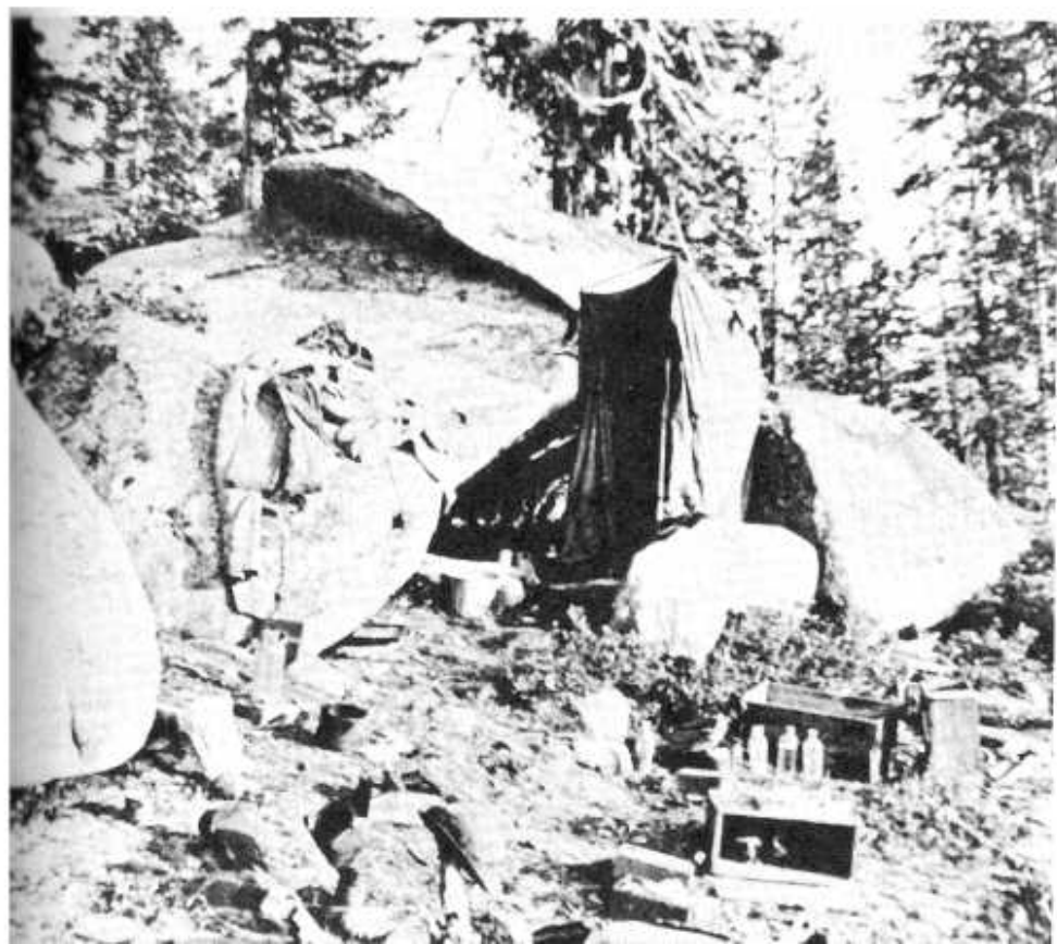
A photographer's field equipment of the 1870's.

One operator, describing a photographic jaunt made about 1860, tells us his camera taking 9" x 11" plates weighed about twenty-one pounds, each plate about one pound. Six pictures were considered a good day's work and a three minute walk from the darkroom tent the limit the photographer dared to go. Again we note that when Monsieur Bisson climbed Mont Blanc, in Switzerland, in July 1861, he had with him a guide