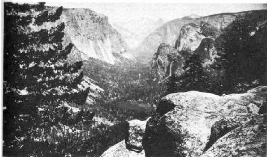
The Yosemite Valley from Inspiration Point Trail, An early Watkins' photograph.