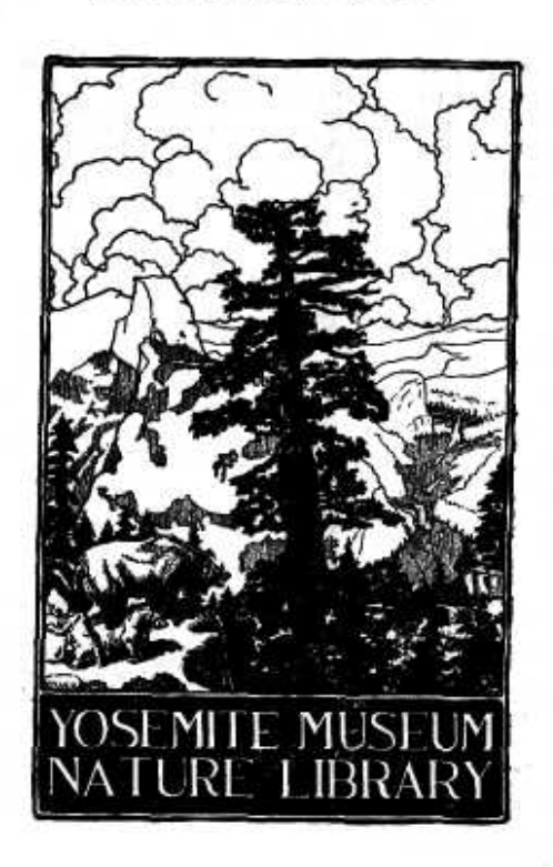
-Persente Dy .--