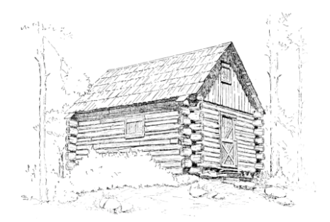
Biledo cabin (type I)

Crane Flat.—Three log structures were erected by the National Park Service in 1915 as guard stations—the Crane Flat cabin, which still stands, although altered in recent years; another, now gone, in the Merced Grove of Big Trees; and the Hog Ranch cabin, which was replaced by the present Mather Ranger Station in 1935. The Crane Flat structure is the most spacious one studied. It originally had an enclosed floor space of 850