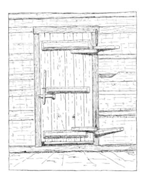
Door of Smith Meadow cabin

Tamarack Lodge .—On the Big Oak Flat Road was a hospice for travelers known as Tamarack Flat Lodge. A photograph taken in 1903 shows the lodge in reasonably good condition. Several bicycles appear in the picture.