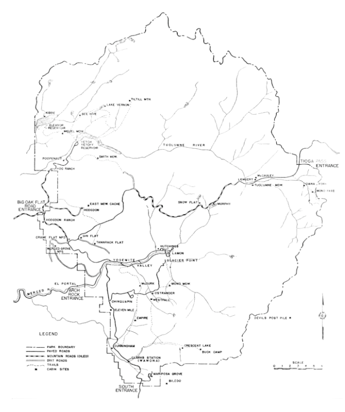
Pioneer cabins in Yosemite National Park