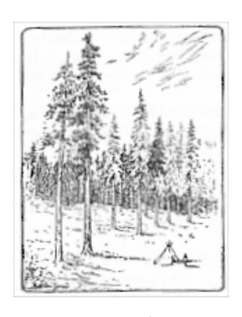
New York The Century Co. MCMXII