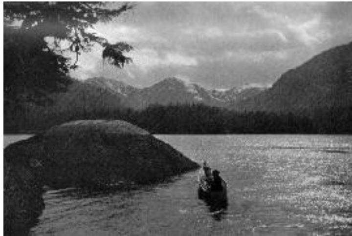
Lowe Inlet, British Columbia

Thus perfectly beautiful are these blessed evergreen islands, and their beauty is the beauty of youth, for though the freshness of their verdure must be ascribed to the bland moisture with which they are bathed from warm ocean-currents, the very existence of the islands, their features, finish, and peculiar distribution, are all immediately referable to ice-action during the great glacial winter just now drawing to a close.