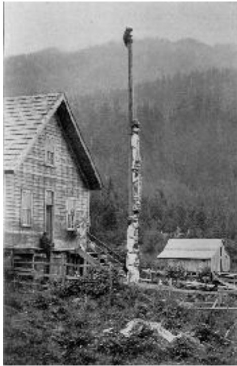
Old Chief and Totem Pole, Wrangell

The carved totem-pole monuments are the most striking of the objects displayed here. The simplest of them consisted of a smooth, round post fifteen or twenty feet high and about eighteen inches in diameter, with the figure of some animal on top—a bear, porpoise, eagle, or raven, about life-size or larger. These were the totems of the families that occupied the houses in front of which they stood. Others supported the figure of a man or woman, life-size or larger, usually in a sitting posture, said to resemble the dead whose ashes were contained in a closed cavity in the pole. The largest were thirty or forty feet high, carved from top to bottom into human and animal totem figures, one above another, with their limbs grotesquely doubled and folded. Some of the most imposing were said to commemorate some event of an historical character. But a telling display of family pride seemed to have been the prevailing motive. All the figures were more or less rude, and some were broadly grotesque, but there was never any feebleness or obscurity in the expression. On the contrary, every feature showed grave force and decision; while the childish audacity displayed in the designs, combined with manly strength in their execution, was truly wonderful.