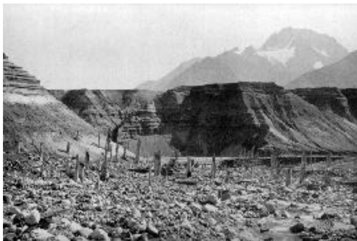
Ruins of Buried Forest, East Side of Muir Glacier

On my way back to camp I discovered a group of monumental stumps in a washed-out valley of the moraine and went ashore to observe them. They are in the dry course of a flood-channel about eighty feet above mean tide and four or five hundred yards back from the shore, where they have been pounded and battered by boulders rolling against them and over them, making them look like gigantic shaving-brushes. The largest is about three feet in diameter and probably three hundred years old. I mean to return and examine them at leisure. A smaller stump, still firmly rooted, is standing astride of an old crumbling trunk, showing that at least two generations of trees flourished here undisturbed by the advance or retreat of the glacier or by its draining stream-floods. They are Sitka spruces and the wood is mostly in a good state of preservation. How these trees were broken off without being uprooted is dark to me at present. Perhaps most of their companions were up rooted and carried away.