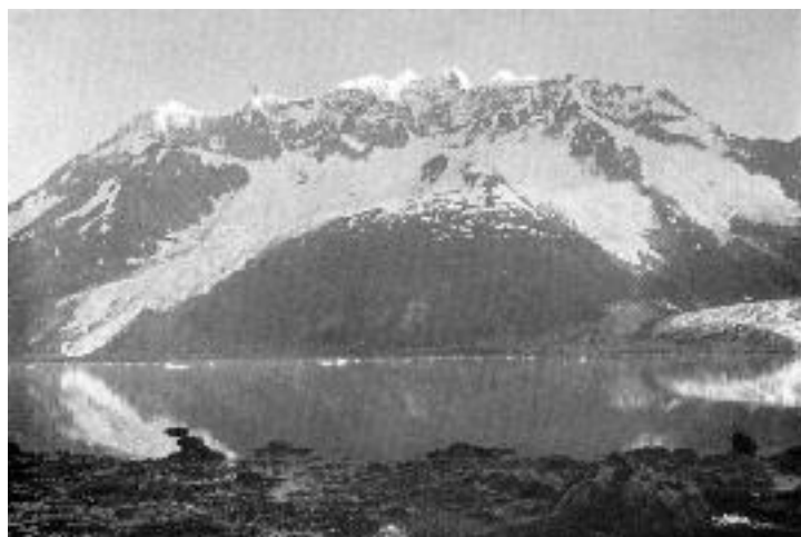
Alpenglow on Summit of Mt. Muir, Harrison Fiord, Prince William Sound