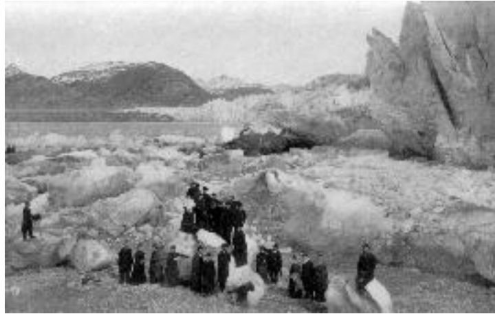
The Muir Glacier in the Seventies, showing Ice Cliffs and Stranded Icebergs

On our way down the coast, after examining the front of the beautiful Geikie Glacier, we obtained our first broad view of the great glacier afterwards named the Muir, the last of all the grand company to be seen, the stormy weather having hidden it when we first entered the bay. It was now perfectly clear, and the spacious, prairie-like glacier, with its many tributaries extending far back into the snowy recesses of its fountains, made a magnificent display of its wealth, and I was strongly tempted to go and explore it at all hazards. But winter had come, and the freezing of its fiords was an insurmountable obstacle. I had, therefore, to be content for the present with sketching and studying its main features at a distance.