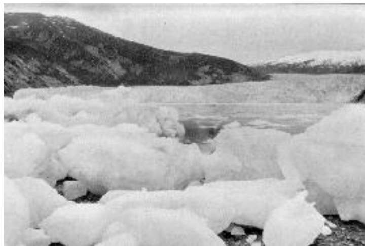
Stranded Icebergs, Taku Glacier

In the morning, however, when the prospectors were to have gone over to the island, we noticed a smoke half a mile back on a large stream, the outlet of the glacier we had seen the night before, and an Indian told us that the white men were building a big log house up there. It appeared that they had found a promising placer mine in the moraine and feared we might find it and spread the news. Daylight revealed a magnificent fiord that brought Glacier Bay to mind. Miles of bergs lay stranded on the shores, and the waters of the branch fiords, not on Vancouver's chart, were crowded with them as far as the eye could reach. After breakfast we set out to explore an arm of the bay that trends southeastward, and managed to force a way through the bergs about ten miles. Farther we could not go. The pack was so close no open water was in sight, and, convinced at last that this part of my work would have to be left for another year, we struggled across to the west side of the fiord and camped.