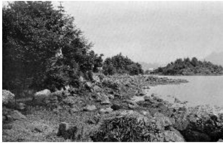
Vegetation at High-Tide Line, Sitka Harbor

Our Hoona neighbors were asleep in the morning at sunrise, lying in a row, wet and limp like dead salmon. A little boy about six years old, with no other covering than a remnant of a shirt, was lying peacefully on his back, like Tam o' Shanter, despising wind and rain and fire. He is up now, looking happy and fresh, with no clothes to dry and no need of washing while this weather lasts. The two babies are firmly strapped on boards, leaving only their heads and hands free. Their mothers are nursing them, holding the boards on end, while they sit on the ground with their breasts level with the little prisoners' mouths.