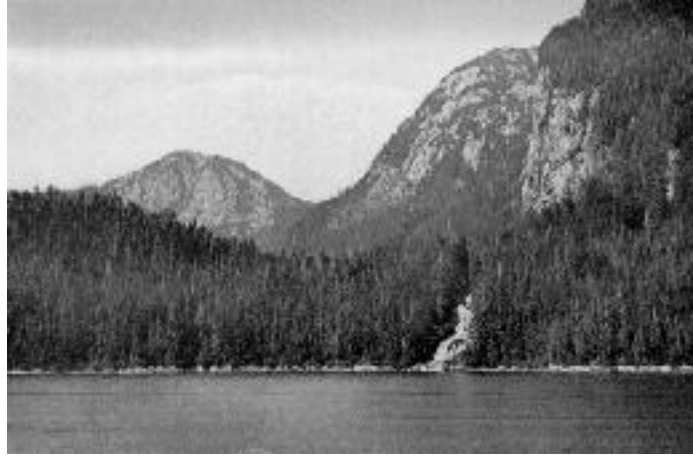
Hangin' Valley and Waterfall, Fraser Ranch

Day after day in the fine weather we enjoyed, we seemed to float in true fairyland, each succeeding view seeming more and more beautiful, the one we chanced to have before us the most surprisingly beautiful of all. Never before this had I been embosomed in scenery so hopelessly beyond description. To sketch picturesque bits, definitely bounded, is comparatively easy—a lake in the woods, a glacier meadow, or a cascade in its dell; or even a grand master view of mountains beheld from some commanding outlook after climbing from height to height above the forests. These may be attempted, and more or less telling pictures made of them; but in these coast landscapes there is such indefinite, on-leading expansiveness, such a multitude of features without apparent redundance, their lines graduating delicately into one another in endless succession, while the whole is so fine, so tender, so ethereal, that all pen-work seems hopelessly unavailing. Tracing shining ways through fiord and sound, past forests and waterfalls, islands and mountains and far azure headlands, it seems as if surely we must at length reach the very paradise of the poets, the abode of the blessed.