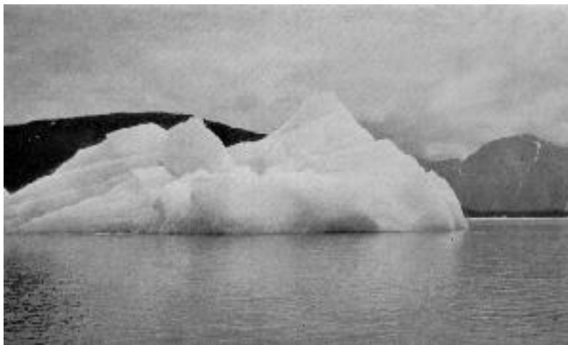
Floating Iceberg, Taku Inlet

A few days later I set out with Professor Reid's party to visit some of the other large glaciers that flow into the bay, to observe what changes have taken place in them since October, 1879, when I first visited and sketched them. We found the upper half of the bay closely choked with bergs, through which it was exceedingly difficult to force a way. After slowly struggling a few miles up the east side, we dragged the whale-boat and canoe over rough rocks into a fine garden and comfortably camped for the night.