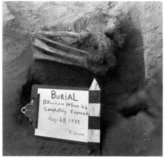
Completed burial excavation, showing bones in situ.