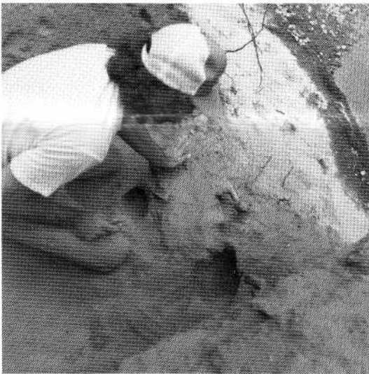
The skeletal remains shown above were partially exposed by erosion and by cautious excavation.

During the summer of 1979 an interesting and unusual occurrence took place. A visitor noticed bones eroding from the high river bank near Housekeeping Camp in Yosemite Valley. Instead of reporting this, he removed many of the bones thus losing for us information that cannot now be retrieved. Because the bones were human, consultation with members of the American Indian Council of Mariposa County was sought and it was decided that it would be appropriate to excavate the remains so that they would not fall into the river.